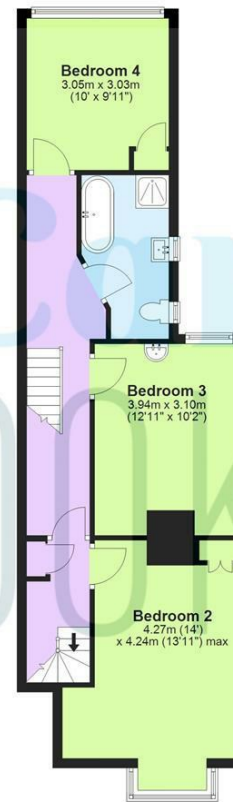
First Floor Approx. 58.0 sq. metres (523.9 sq. feet)